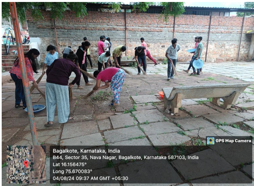
swachhta program on 04/08/2024