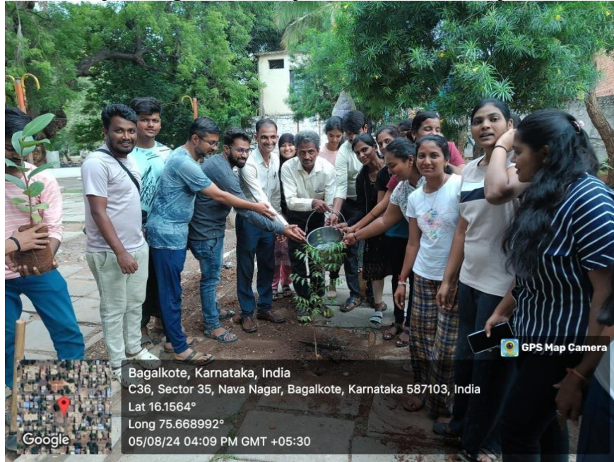
Environmental promotional activity on 5/8/2024

Students volunteered in a free health check-up camp swachhta program and tree plantations at nearby village voluntary Blood donation by students.