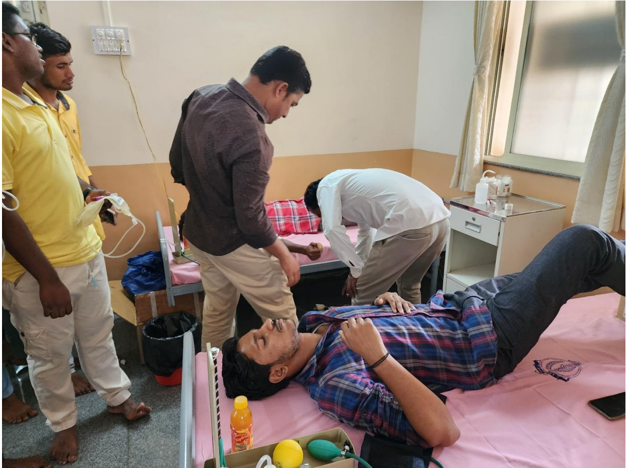
Students involved in Blood Donation