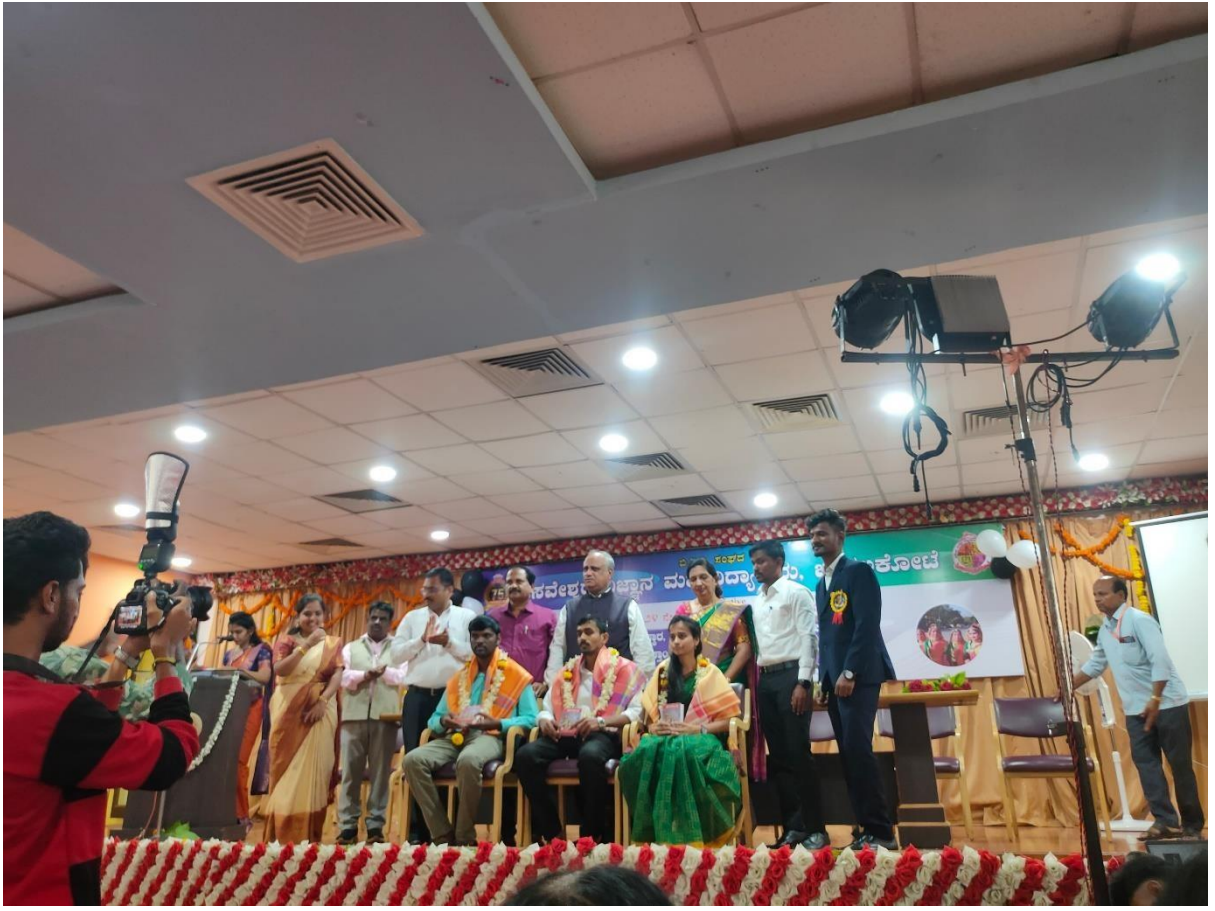
Felicitation to the teachers who cleared K-SET examination during year 20232024 on 03-01-2024 in Pratibha Purskar.