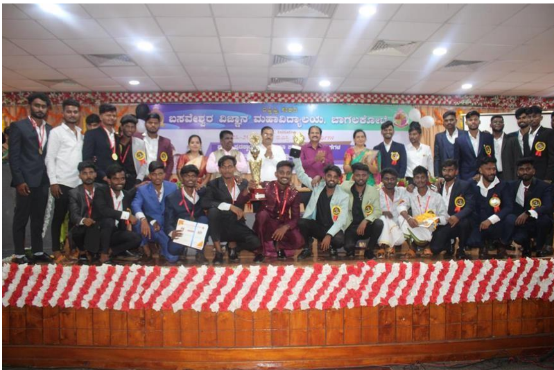
Felicitations to the students who participated in Sports and won the First Prize during year 2023-2024 on 03-01-2024 in Pratibha Purskar.