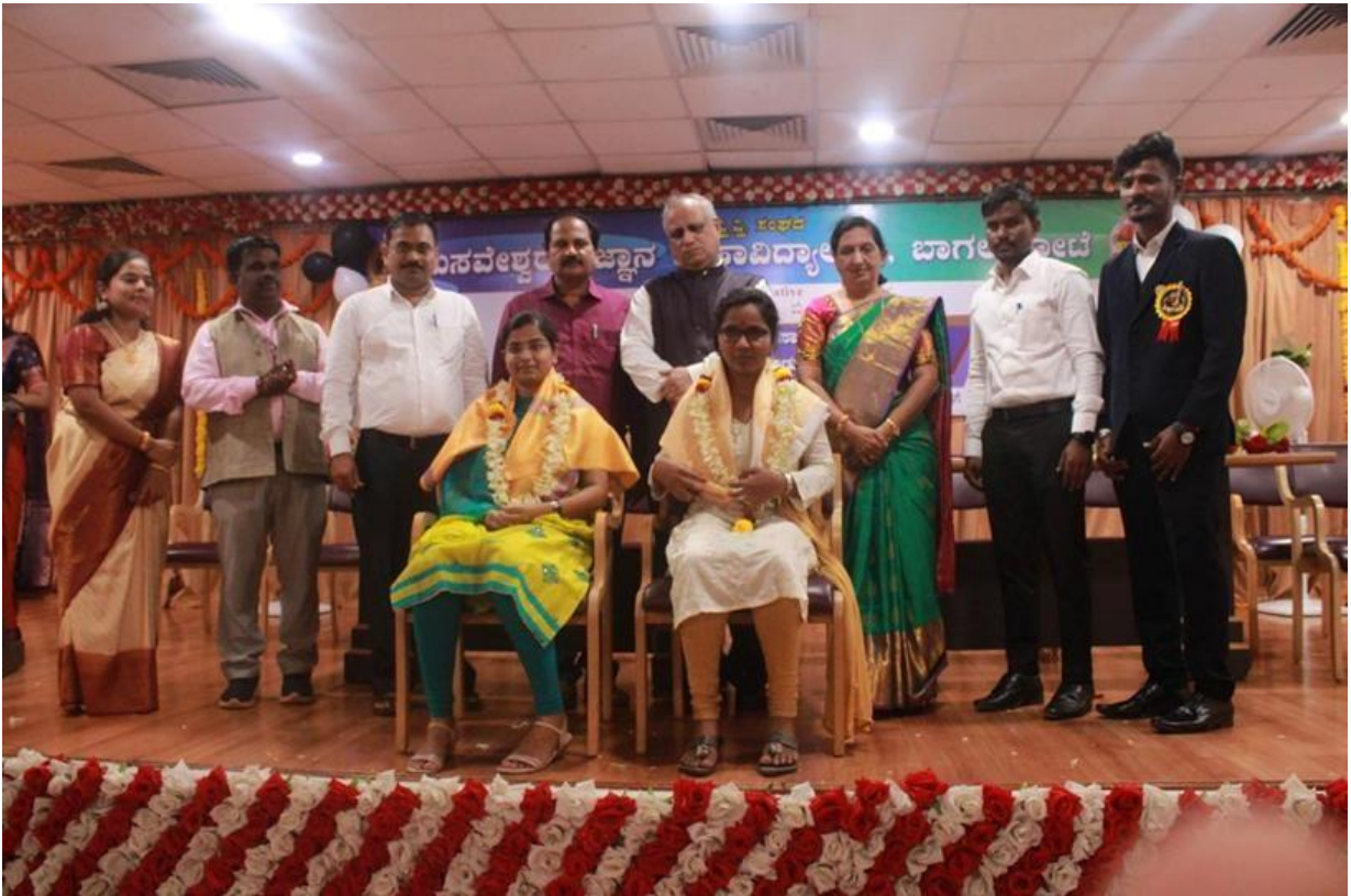
Felicitations to PG students who cleared K-SET examination during year 2023-2024 on 03-01-2024 in Pratibha Purskar.