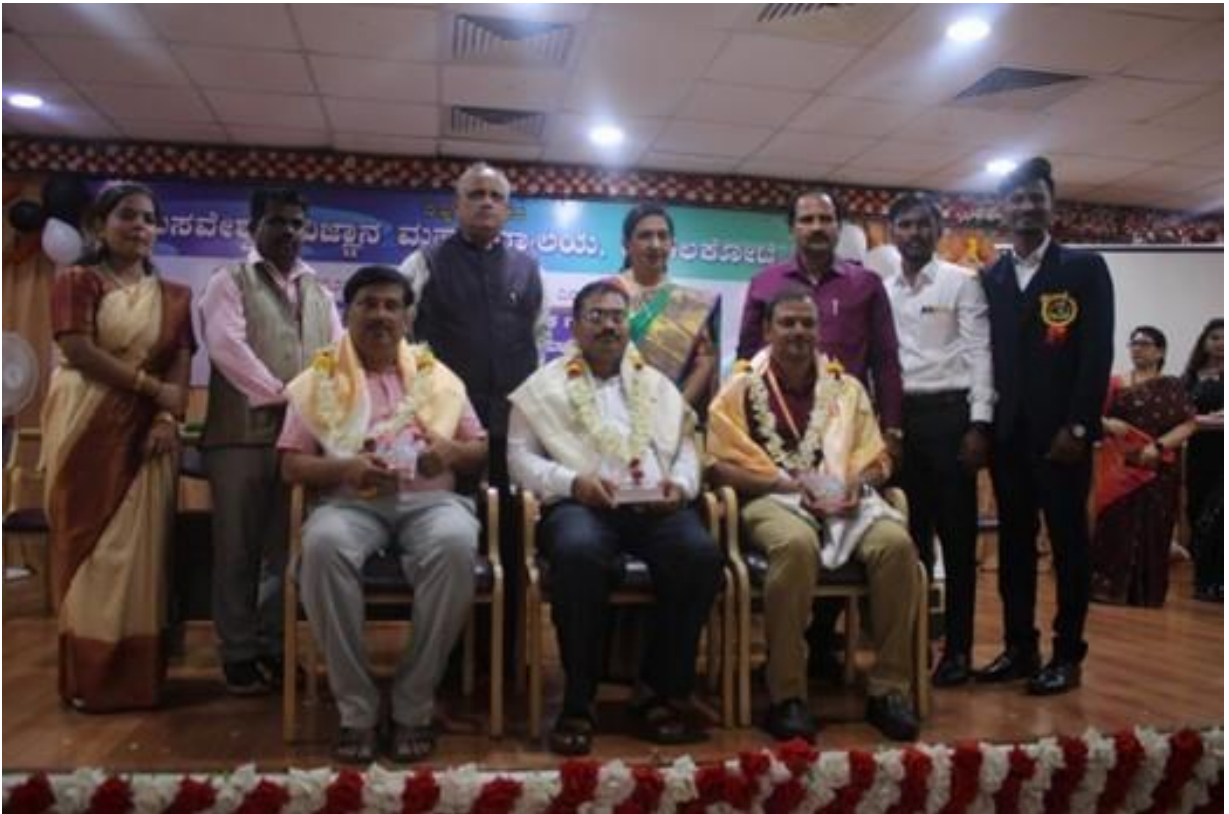
Felicitation to Teachers who became IGNOU counsellors during year 2023-2024 on 03-01-2024 in Pratibha Purskar.