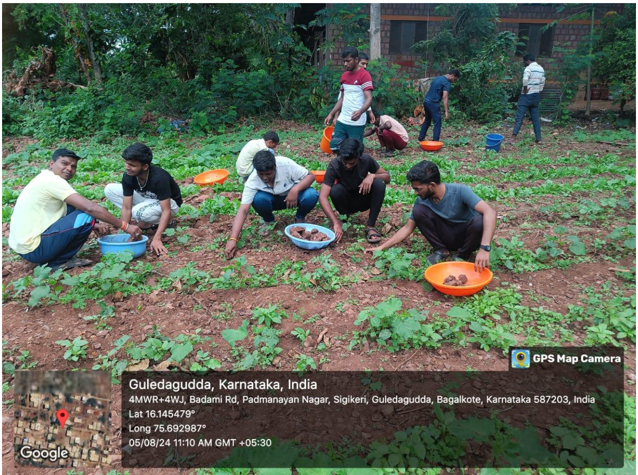
Students involved in Swachhta Program

Guledagudda, Karnataka, India 4MWR+4WJ, Badami Rd, Padmanayan Nagar, Sigikeri, Guledagudda, Bagalkote, Karnataka 587203, India Lat 16.145479° Long 75.692987° 05/08/24 11:10 AM GMT +05:30